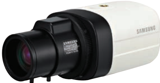
* Lens not included